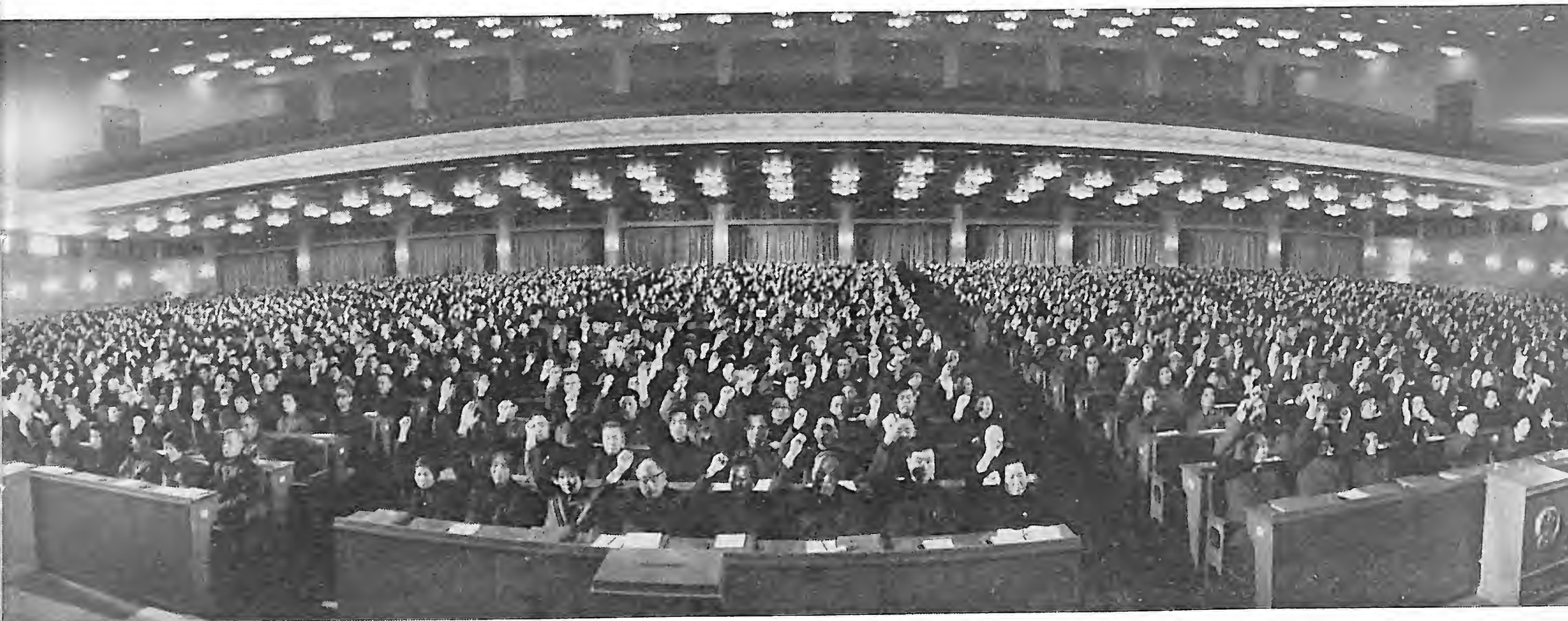
The Congress in session